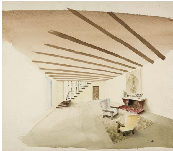
Fig. 3. Franz Ehrlich: Design for a representative hallway with fireplace and staircase for the villa of a SS leader in the Buchenwald concentration camp, undated, 1938–1941; pencil and watercolour on watercolour paper, 38.0 x 41.0 cm

In the construction office, Ehrlich designed, among other things, representative villas for the SS leaders and smaller residential buildings, a commandant's casino, a forest restaurant, an SS home, an animal enclosure, and a falconry for the concentration camp, which was only finished in July 1937, and its ambitious commandant, SS-Standartenführer (Oberst) Karl Otto Koch. The falconer's house of the falconry, a simple half-timbered house with a gable roof, was relocated after the end of the Second World War and now stands as a privately used residential building not far from Weimar in Nohra, district of Ulla. 28