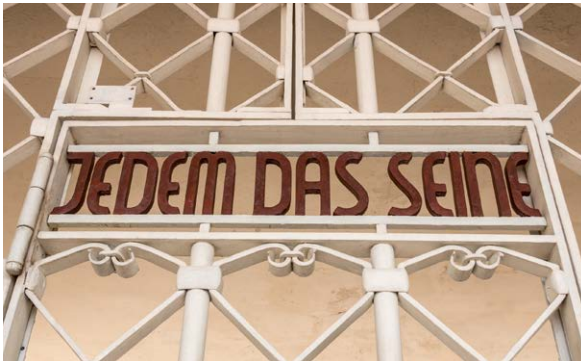
Fig. 4. Franz Ehrlich: Weimar, Buchenwald Memorial, Gate, 1937/38

The construction office at Buchenwald concentration camp is also active for other SS offices. Among other things, Ehrlich designed a restaurant in the SS settlement near Sachsenhausen concentration camp, an SS training home near the Wartburg, and villas and flats for SS leaders in and around Berlin. Among them was the official villa for the head of the Inspectorate of Concentration Camps, 32 the then SS-Gruppenführer (Generalleutnant) Theodor Eicke. 33 Today the building is used as a youth hostel, named House Szczypioski, after a former Polish prisoner of the Sachsenhausen concentration camp.