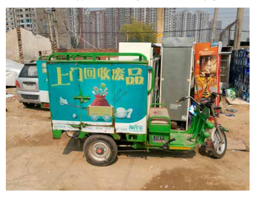
Illustration 2.3 A van operated by Taoqibao, at a Qianbajia waste collection point, formerly part of Henan Village, Haidian District, Beijing