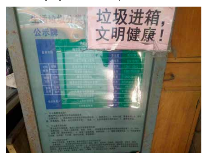
Illustration 3.2 A signboard put up in a residential community providing information on garbage classification and separation. The message stuck on the board urges people to dispose of their garbage in the bins, in order to promote civilization and health