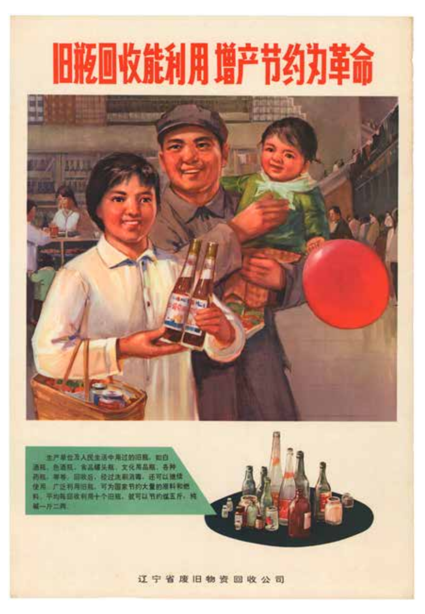
Illustration 1.2 Liaoning Old and Used Goods Collection Company (辽宁省废旧物资回收公司). 'Recycle old bottles to use them again, increase production and be thrifty for the revolution' ('旧瓶回收能利用增产节约为革命')

Liaoning Old and Used Goods Collection Company, 1960s?, circulation unknown IISH/Stefan R. Landsberger Collection. Photo © International Institute of Social History