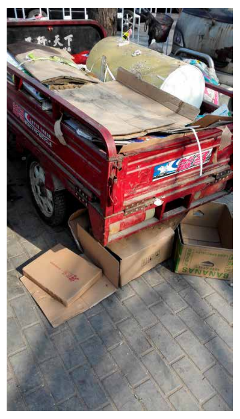
Illustration 4.2 Paper and cardboard at a Xiyuan Bridge collection point, Haidian, waiting to be moved for further processing