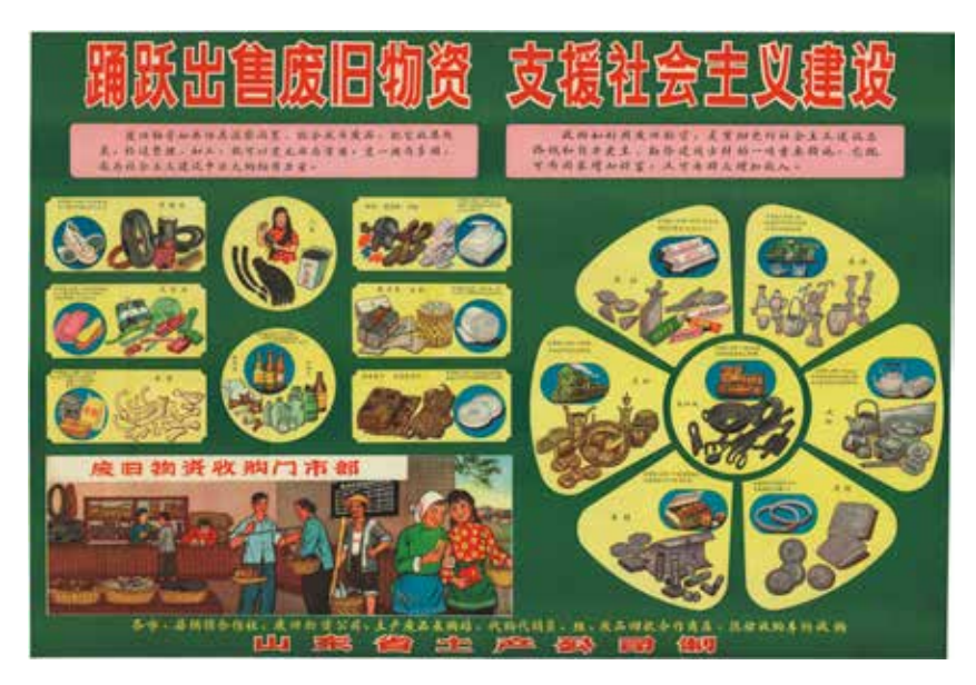
Illustration 1.3 Shandong Provincial Local Products Company (山东省土产公司). 'Eagerly sell old and useless materials to support the construction of socialism' ('踊跃出售废旧物资支援社会主义建设')

Shandong Provincial Local Products Company, 1960s?, circulation unknown IISH/Stefan R. Landsberger Collection. Photo © International Institute of Social History