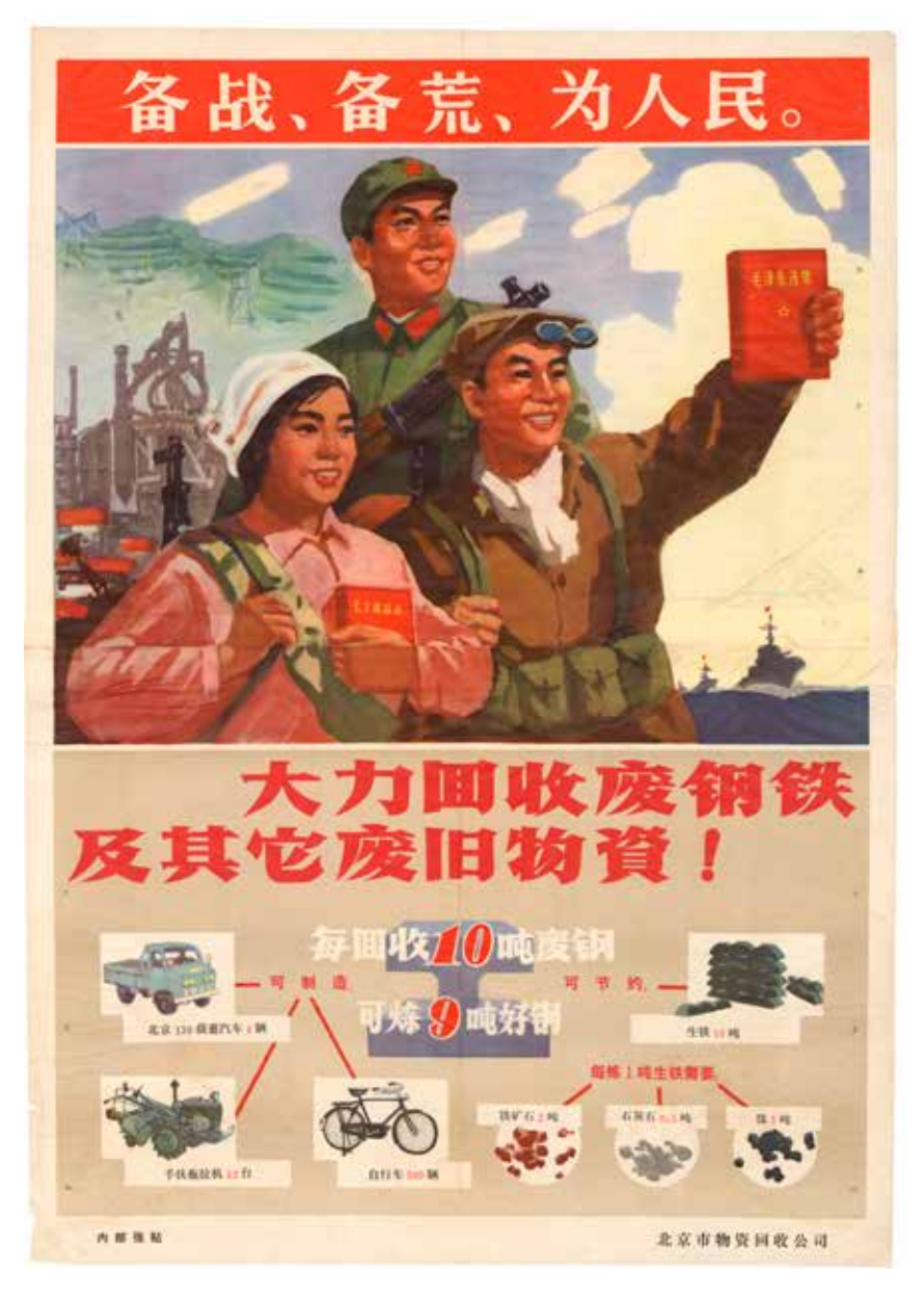
Illustration 1.5 Beijing Municipal Scrap Recycling Company (北京市物资回收公司). 'Strive to collect scrap metal and other waste materials!' ('大力回收废钢铁及其他废旧物资!')

Beijing Municipal Scrap Recycling Company, early 1970s, circulation unknown (internal use) IISH/Stefan R. Landsberger Collection. Photo © International Institute of Social History