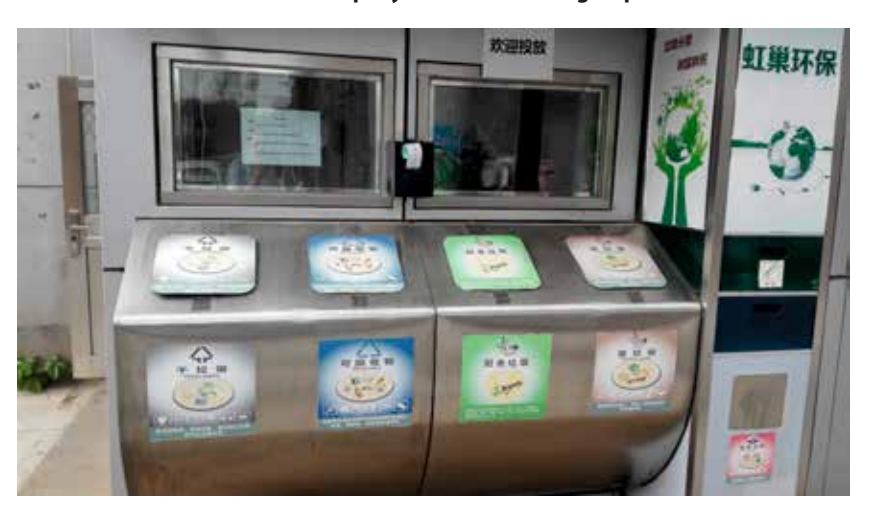
Illustration 3.4 Front view of a Red Nest in a Shunyi District residential community, designed and operated by the Hong Chao (Red Nest) Enviro-Tech Company. Note the RFID tag dispenser