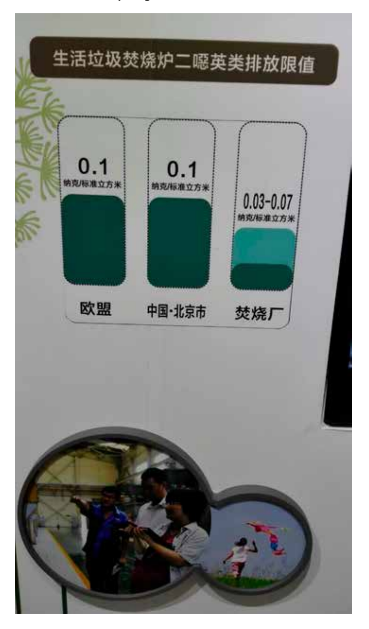
13 March 2017