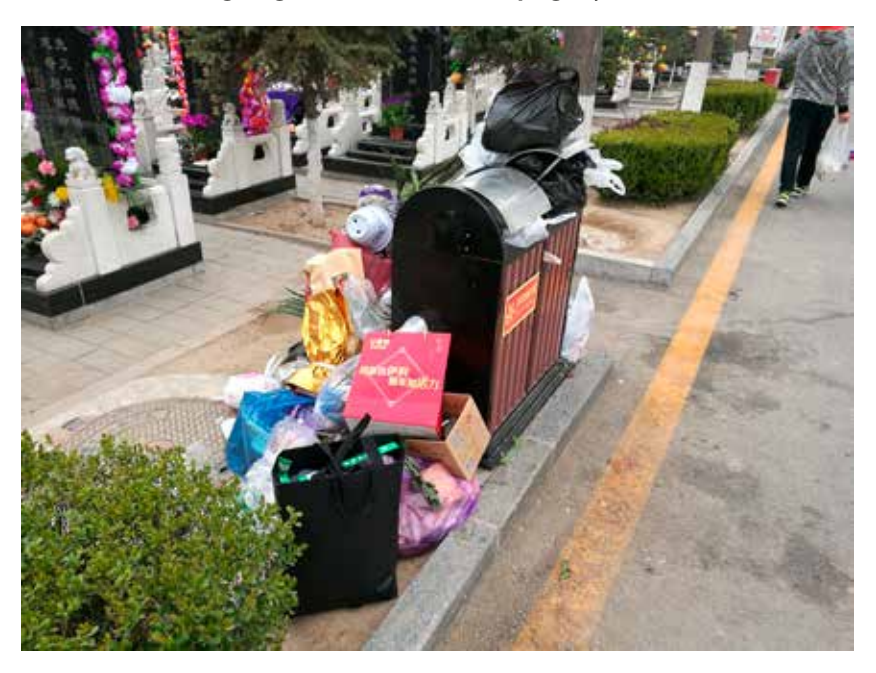
Illustration 5.1 Overflowing waste bins at a Beijing cemetery during the 2017 Qingming Festival, or Tomb sweeping day