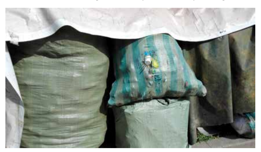
Illustration 4.1 Collected PET bottles and assorted plastics waiting to be moved to the next higher collection point for further processing, Haidian