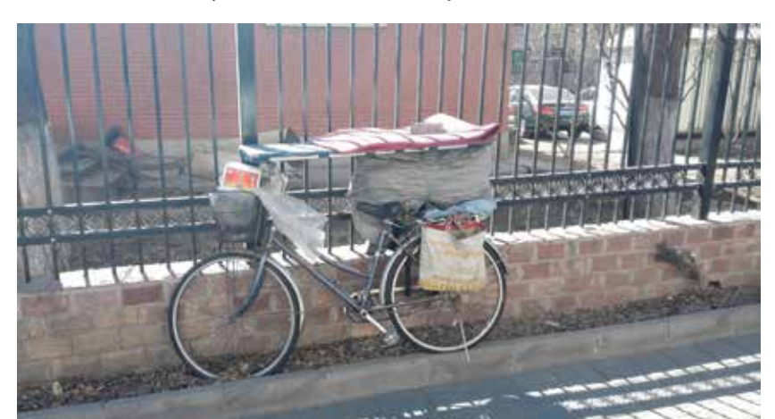
Illustration 4.3 A bicycle loaded with collected junk, Haidian District