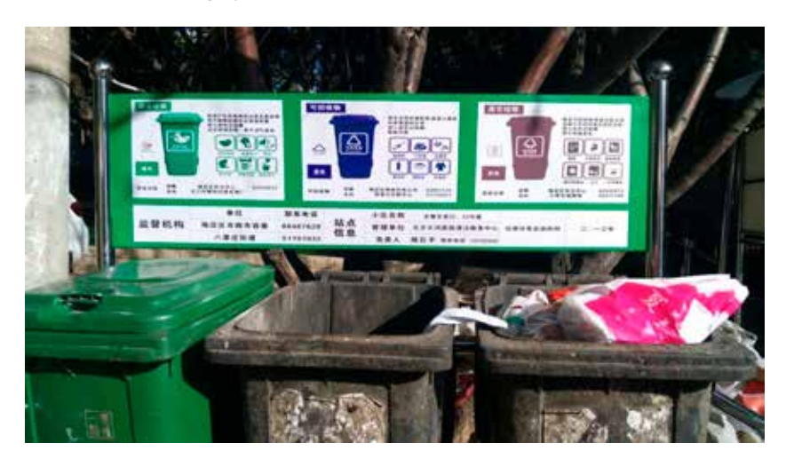
Illustration 3.1 Communal garbage bins on the grounds of a residential community. The sign indicates which garbage needs to go into which bin