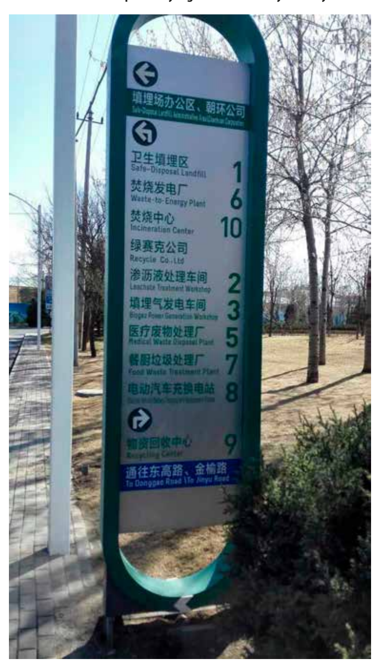
Illustration 7.1 Signpost showing directions to the various facilities at the Beijing Municipal Chaoyang Circular Economy Industry Park