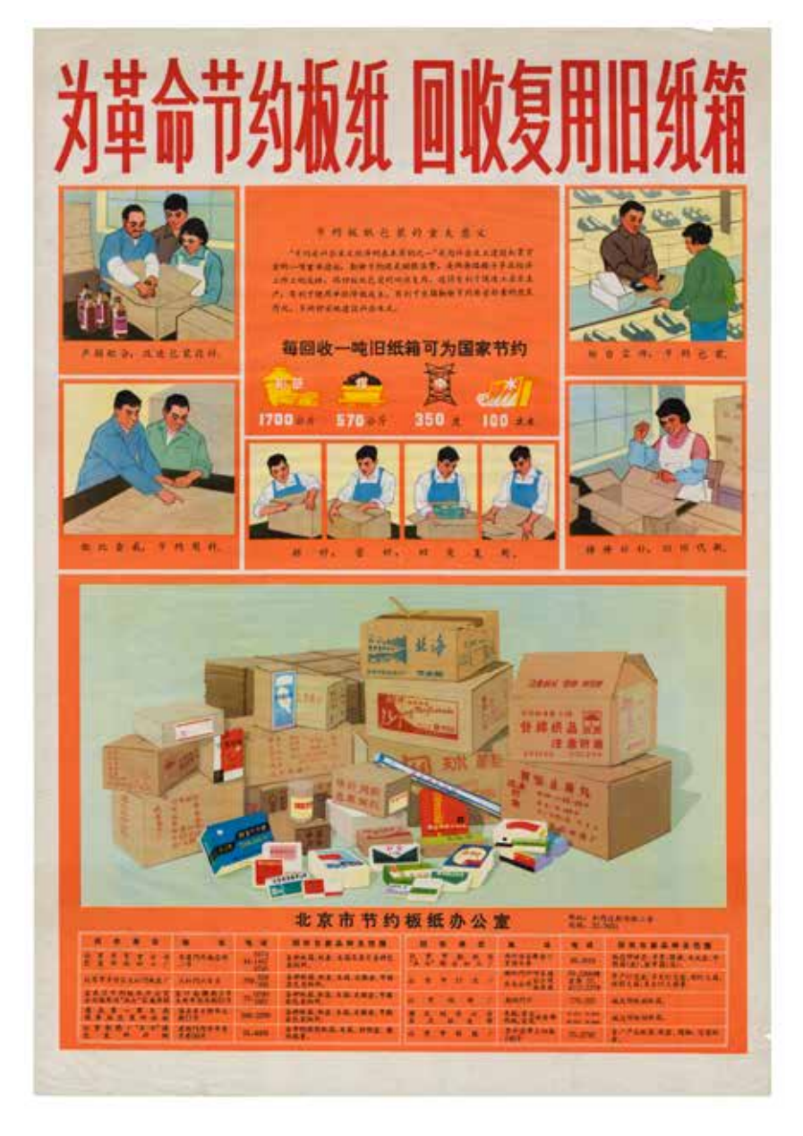
Illustration 1.4 Beijing Municipal Office for Saving Paper (北京市节约板纸办公室). 'Economize on paper for the revolution, collect and re-use old paper boxes' ('为革命节约板纸回收复用旧纸箱')

Beijing Municipal Office for Saving Paper, date of publication unknown, circulation unknown IISH/Stefan R. Landsberger Collection. Photo © International Institute of Social History