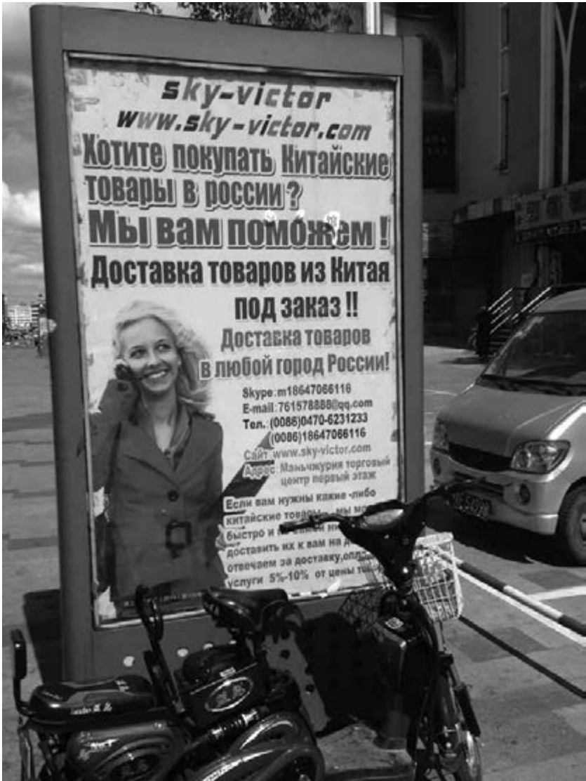
Figure 17 Advertisement for a company offering help with on-line purchases in Manzhouli, China

to the brothers' invention (i.e. they are mediators between Russian purchasers and the Chinese bazaar), but some are more similar to the technical architecture of Taobao itself. For example, the company 'Russian Bridge' simultaneously offers online shopping on Taobao and other means and