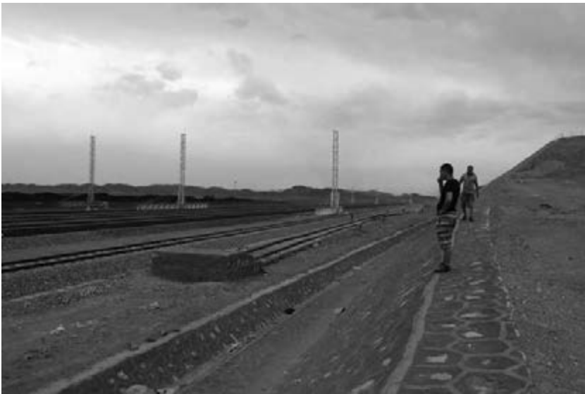
Figure 8 Buyan standing reflectively by an unused railway, 2013

China and Mongolia have been trying to find a common ground by linking their 'Belt and Road' and 'Steppe Road' projects at the governmental level, as laid out by the presidents (Mongolian: tolgoi , 'heads') of the two states in recent years. This is a basic framework for cooperation that needs to be activated through more practical connectivity between them, including infrastructural hardware like railways (see Figure 8), roads, or tunnels, as well as cultural and social interaction between the two peoples. In other words, the cooperation between the two countries not only relies on good