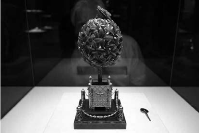
Figure 15 Carl Fabergé's Easter egg, made predominantly of jade from a private collection of Viktor Vekselberg, the fourth richest person in Russia. The object is on display at special private museum in Saint-Petersburg, Russia

was part of an elitist lifestyle and jade was never reconfigured as a Russian stone in a democratic sense: it did not become popular or recognizable, and no artisan craft arose to work the stone into objects of value. This situation was in some ways similar to the heyday of jade in Chinese history, when only the members of royal family and those close to it were permitted to own jade. Even though jade objects like imperial eggs are of Russian origin, their price now is determined at auctions abroad, and foreign experts play important roles in the process. In this respect Russian buyers are similar to Chinese ones: they buy these objects because of the emotional ties they feel towards them.