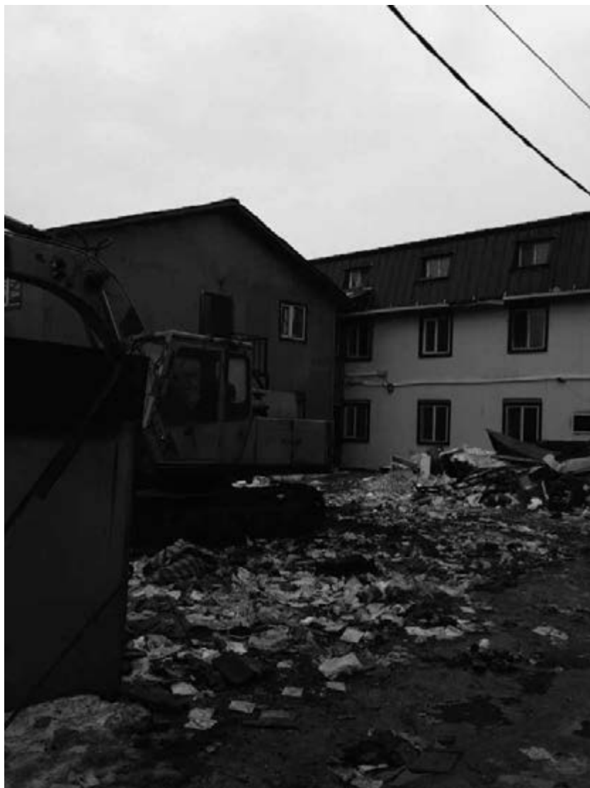
Figure 9 Chinese market in Ussuriisk, 2016

Earlier, it had been the precarious balance of the mutuality of two parties across the border that had enabled the frontier market economy to be sustained and flourish. In accounting for what happened next, it is useful to refer to Gellner. According to him (1988, 143), it is often the state ‘that destroys trust’, replacing the delicate equilibrium of social cohesion with