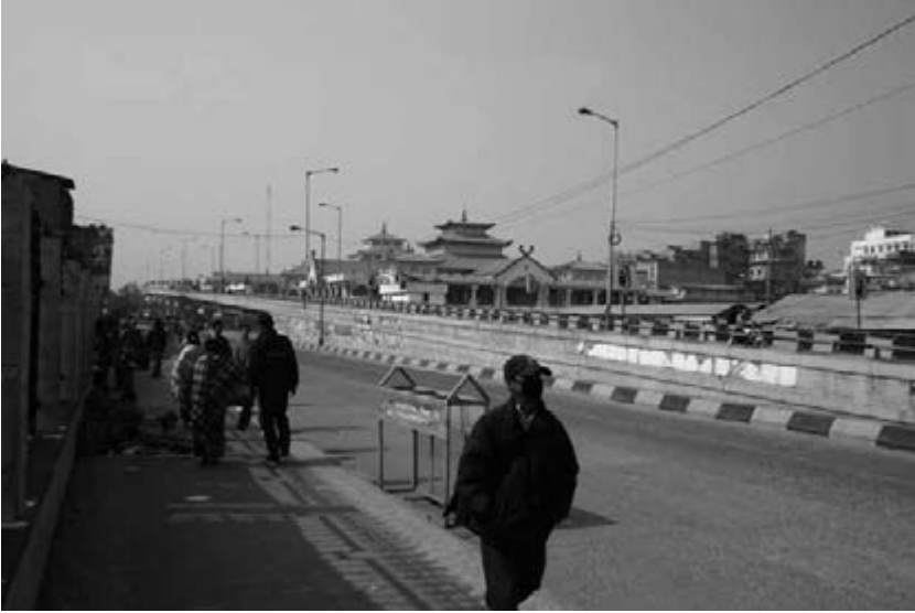
Image 3.2 Bir Tikendrajit Flyover with the Ima Keithel behind

separate market. Cases like this are used to equate the civilian government to the interests of the Meitei population. Many vendors, including Meiteis, tribals, Pangals, and mayangs (non-Manipuris) sell their wares illegally on the pavements, staircases, and ‘gullies’ around the Ima Keithel. This is a popular spot for crackdowns by the Manipur Police and VDF, who clear (or threaten to clear) the area every hour or so with loudspeakers and lathis . Vendors, mostly all women, gather their wares and run to safety around a corner. They are rarely pursued, rather police wait until they return and then extract bribes. This compromise can benefit both sides, though vendors are highly vulnerable to repeated requests each day from different authorities. Unlicensed traders have also occupied other spaces in defiance of the civilian authorities’ attempts at spatial control – including permanent occupation of a nearby market area created to temporarily house licensed traders during the renovation of Ima Keithel.