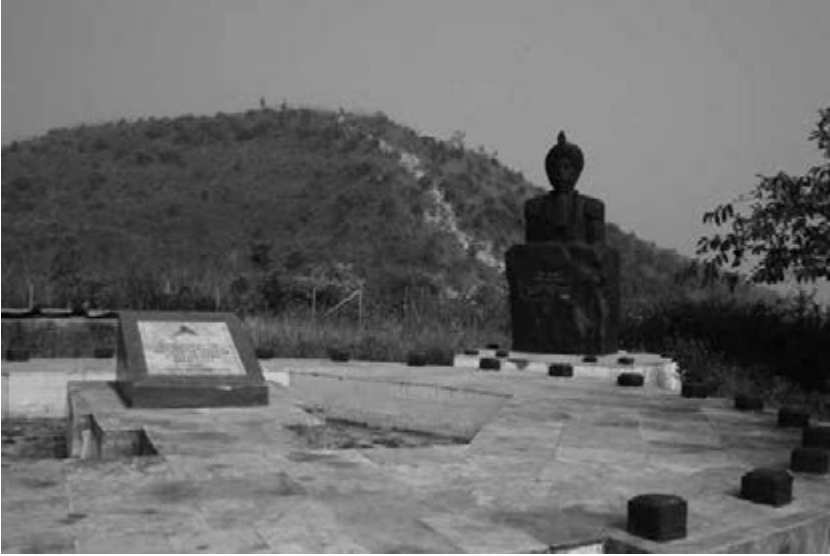
Image 3.3 PLA Memorial at Cheiraoching

Manipur in an era before the splintering of the polity and the ascendancy of hill-valley politics. Ironically it is an organ of the Indian state, the Guwahati High court, which enables families to pay tribute to secessionist relatives without being arrested or harassed by the armed forces. Each year the families go through the process of seeking High Court permission, itself a bureaucratic ritual to enable the memorial ritual. Clearly the state is able to co-opt the Nupi Lal and Irabot for nationalist narratives. The PLA is a line the state cannot cross in its appropriation of resistance.