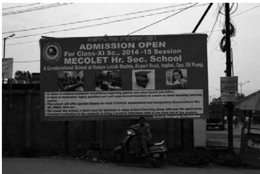
Image 7.2 Advertisement for a secondary school, DM campus