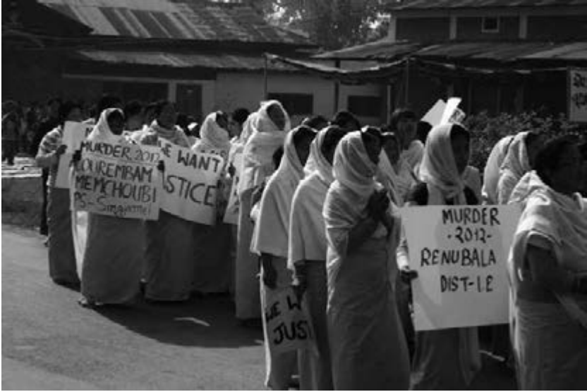
Image 8.1 Start of the rally, Haobam Marak Lourembam Leikai

goods from the border market at Moreh had lost its load as it took the sharp right turn for the final stretch into the city. On both sides of the road red and blue plastic basins, stools, and tied bundles of blankets in plastic covering were scattered. One of the passengers was trying to pick them up while two police spoke to the driver. A man got out from the vehicle behind, itself laden with mattresses, and helped collect the scattered goods and soon the traffic was flowing again.