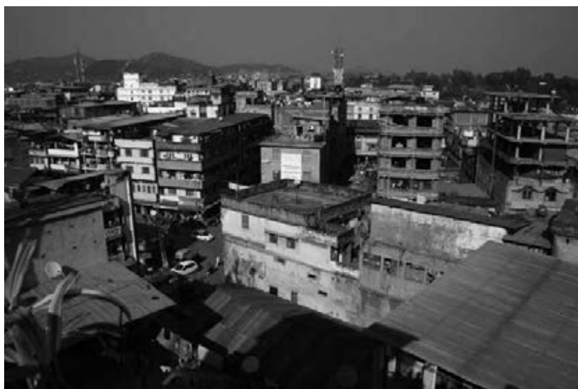
Image 2.1 Central Imphal facing north

Official figures for population density are calculated on district population figures: Imphal East has 643 persons per square kilometre and Imphal West has 998 persons per square kilometre (Census of India, 2013). As these also include peri-urban and rural areas it is likely that parts of the city have a much higher density and areas away from the city have much lower density. For perspective, the average density in Manipur is 115 persons per square kilometre, and thus population density of the valley is much higher than the hills. Decadal population growth in Imphal East was recorded at 69% and Imphal West 15% for the period 2001-11. Even based on these limited figures it is clear that Imphal is a relatively small city of between half a million and a million people, is densely populated when compared to the rest of the state, and it is growing.