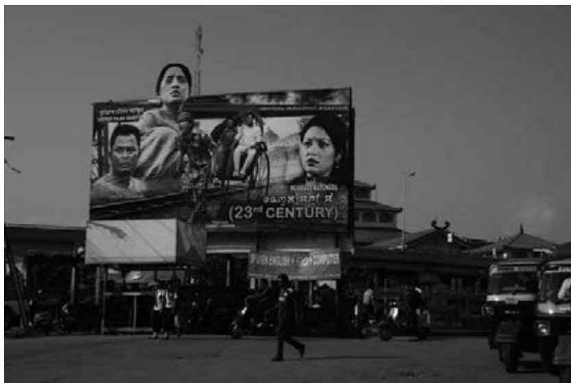
Image 4.1 Advertisement for 23 rd Century , Salam Leikai

a colonial regulation and currently in force in neighbouring Mizoram and Nagaland. The music video for the lead song from 23 rd Century even features clips of the protests calling for the ILP equating the story in the film with the contemporary movement to exclude non-Manipuris from the state. The film also comes at a time of public debate over the merits of the proposed extension of the North East Frontier Railway to Imphal through Jiribam, on the border between Manipur and Assam, due for completion in 2016. Land seizures, displacement, and environmental damage brought by the construction of bridges and tunnels has sparked sporadic opposition, however, the implications of easier entry to Manipur and easier access to Imphal, especially though train travel which in India is still the primary mode of transport for the poor and middle class, strikes at the core of anxieties over territory, belonging, and identity. These anxieties are captured in the film but they also play out in contemporary Imphal where exclusion provides the counterpoint to belonging in a city controlled by state, quasi-state, and non-state actors.