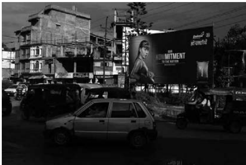
Image 5.1 Billboard featuring Mary Kom, Khoyathong

main commercial areas on advertisements for soap, phone companies, and banks. As with all signs in Imphal, whether featuring a Northeast singer or a Bollywood star, the logo and slogan that one would see elsewhere in India is accompanied entirely or in part by a translation in Meitei and written in the Meitei Mayek script. It is very uncommon to find a sign without Meitei Mayek script somewhere on it, and those without it don't last long and are dismantled by ethno-nationalist groups.