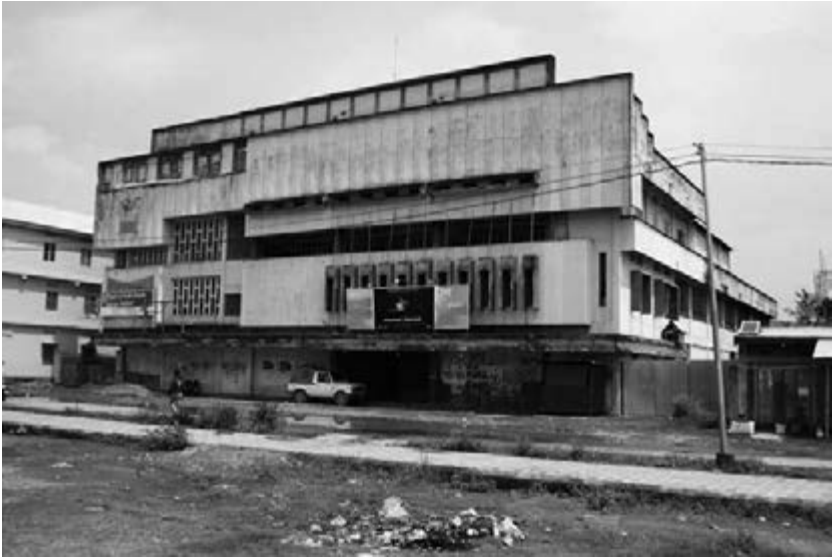
Image 1.1 Shanker Talkies, Lamphelpat