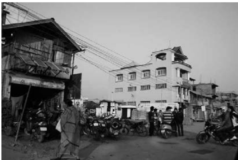
Image 2.2 Multi-storey houses alongside partially completed houses, Uripok Khumanthem Leikai

photographs of mansions from abroad, the use of building contractors rather than architects, materials of questionable durability, and inexpensive labour from outside the city all intended to ‘demonstrate power through confections that bear little reality to tradition, aesthetics or living requirements’ (2008: 36). Though I am more hesitant, and less qualified, to pass judgement on the aesthetics of the equivalent style of construction in Imphal, the social, political, and economic dynamics that produce it are comparable. Construction must also be considered with reflection on the destruction that has taken place in the city historically, and in living memory through the Second World War, occupation by the Indian state, and interethnic violence.