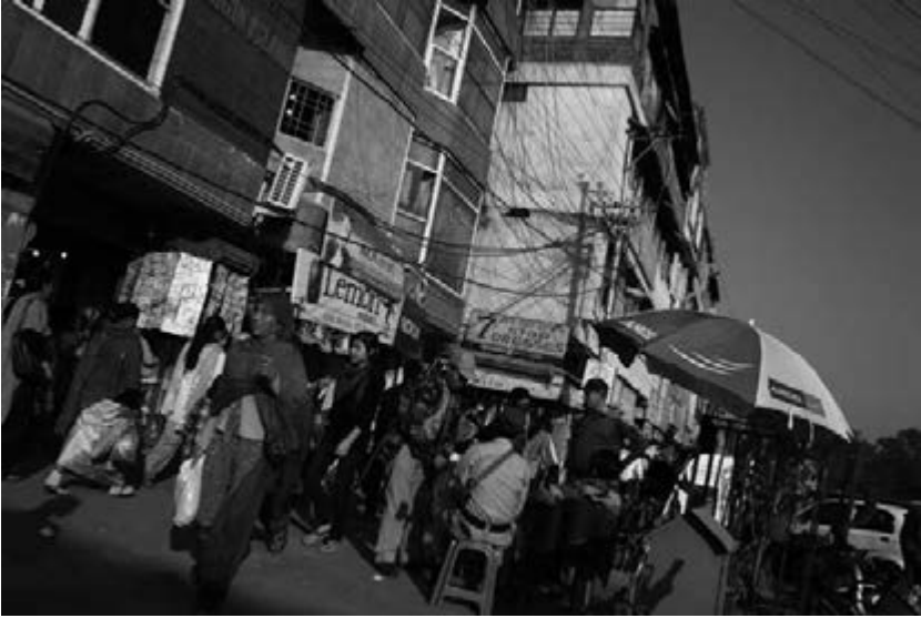
Image 3.1 State Police at Thangal Bazaar

Rifles and Manipur Commandos. Personnel from these forces can often be seen wearing face masks obscuring their features lest they be identified and subject to retribution by members of the public and underground groups. The Manipur State Police undertake more of the mundane actions controlling what happens in different parts of the city, such as evicting illegal vendors, raiding premises serving alcohol, enabling and denying access to sensitive locations, and traffic duty. Some of these tasks are left to the Village Defence Force (VDF); voluntary militias armed by the Manipur Government to provide security in villages and neighbourhoods.