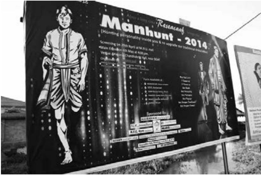
Image 2.3 Manhunt billboard, LIC Point