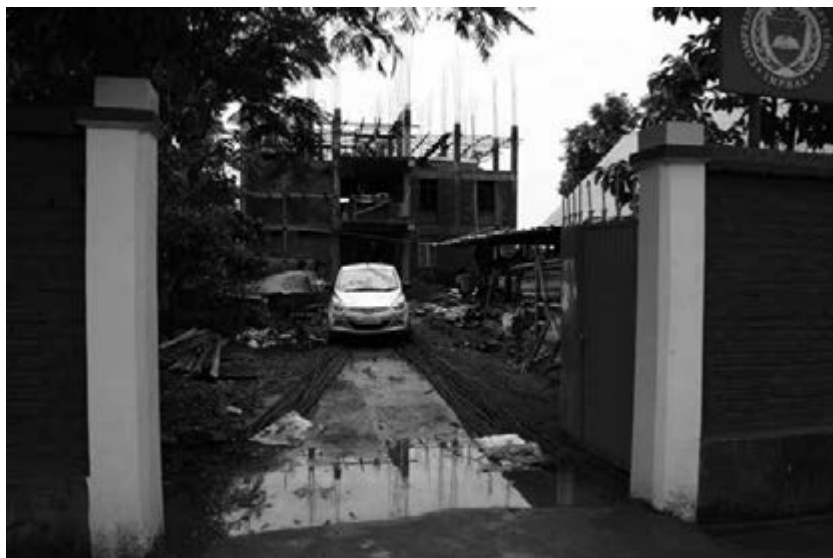
Image 7.1 School under construction, Sangaiprou

of various sizes and styles; some with brightly painted bricks, others with mirrored glass, others with patterned concrete and tiles. Hostels are found in similar buildings with walls, gates and guards and also within local houses. Some houses advertising hostel accommodation have extra floors or outbuildings added. Electricity poles and walls are plastered with advertisements for tuitions, hostel rooms, and – after exam results – banners strewn between walls and poles featuring headshots of successful students with details of their grades and position in the state in various subjects. There is also evidence of a bust accompanying the boom. Empty buildings with the school or hostel name faded or painted over, buildings sinking into the soil or with parts of wall missing, and vegetation and cattle reclaiming seldom used lots.