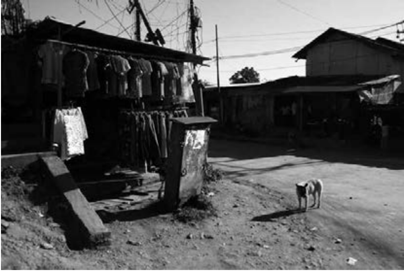
Image 5.2 Local clothes shop, New Checkon