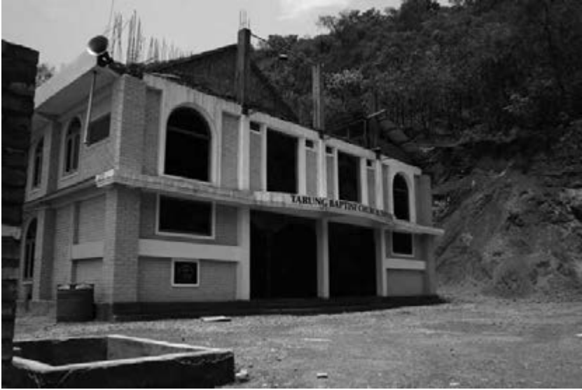
Image 6.2 Baptist church under construction, Langol

vans), and Shija's own commuter buses. Doctors started to purchase land and build houses close to the hospital. The area became a desired location for Imphal's professional classes, driving up the cost of land. Investment in guesthouses and restaurants to serve the visitors to the hospitals has increased the value of land by the road. Developers, rumoured to be backed by Imphal politicians, have levelled more of the foothills for construction. Notable among the new mansions are several drug rehabilitation homes, a yoga retreat, and a Hindu mandir (under construction in mid-2014).