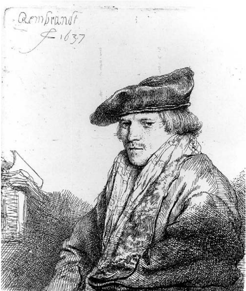
4: Rembrandt van Rijn, Portrait of Petrus Sylvius, Etching, 96 x 82 mm, Amsterdam, The Rembrandthuis