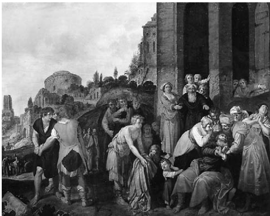
10: Jan Pynas, "Jacob Seeing Joseph's Bloodied Coat", Panel, 90 x 119 cm, The State Hermitage Museum, St. Petersburg

known for his broad religious views, which included an interest in, and sympathy for, the Jewish faith. He became friends with Rabbi Menasseh ben Israel, whose book on the Creation he went out of his way to praise (an attitude for which he was roundly castigated by Orthodox Calvinists). After the death of his first wife, he courted Maria Tesselschade Roemer, the daughter of Roemer Visscher, the author of the Sinnepoppen , who was herself a poet and a charter member of the Muiden circle; but his courtship was unsuccessful, even though they remained close friends until her death. He was a prolific writer of poems in Latin and an occasional playwright.