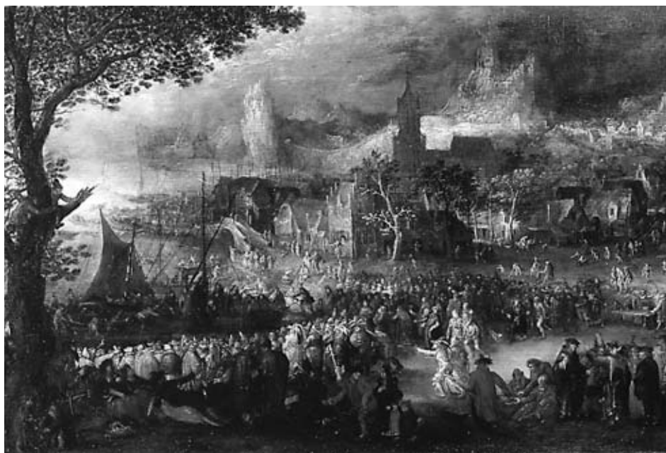
13: David Vinckboons, "Christ Preaching on the Edge of the Sea", Panel, 34 x 45 cm, Sweden, Private Collection

tory. The other two paintings that he acquired in 1620 ("a skull" and "a landscape of the Man of God") cannot be traced to his death inventory. 839