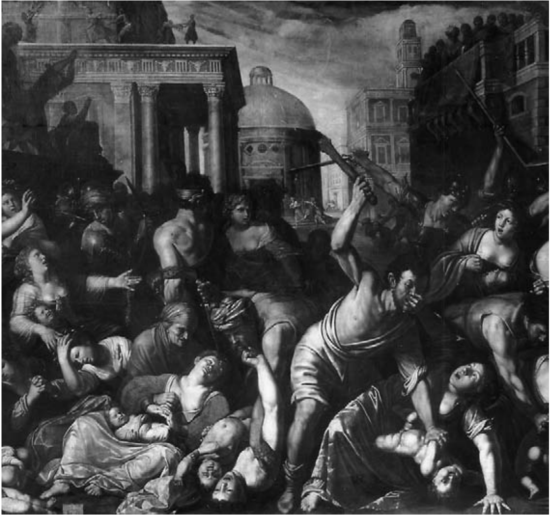
2: Louis Finson, "The Massacre of the Innocents", Canvas, 270 x 400 cm, Eglise Saint-Begge