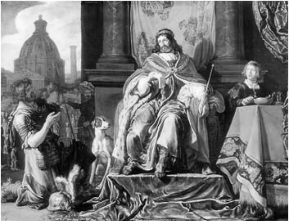
11: Pieter Lastman, “David and Uriah”, 50 x 62 cm, Panel, The Hague, Mauritshuis