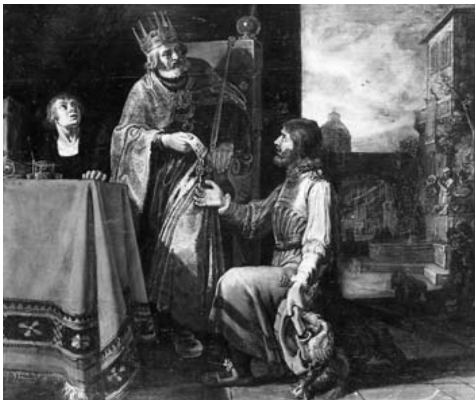
12: Pieter Lastman, "King David Handing the Letter to Uriah", 50.8 x 60.96 cm, Panel, Detroit, Museum of Fine Arts