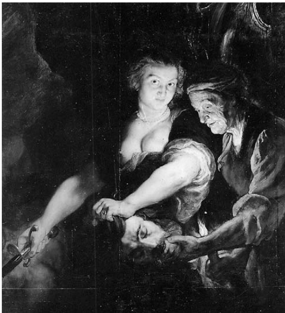
3: Pieter Paul Rubens, “Judith and Holofernes”, Panel, 120 x 111 cm, Braunschweig, Herzog Anton Ulrich-Museum