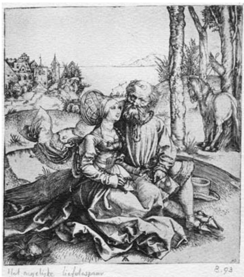
6: Albrecht Dürer, “The Offer of Love” ( De tasvloyer ), 93 x 89.1 mm, Engraving