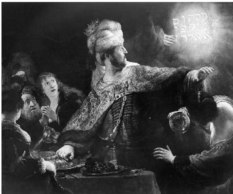
8: Rembrandt van Rijn, “Belshazzar Sees the Writing on the Wall”, Canvas, 167.6 x 209.2 cm, London, National Gallery