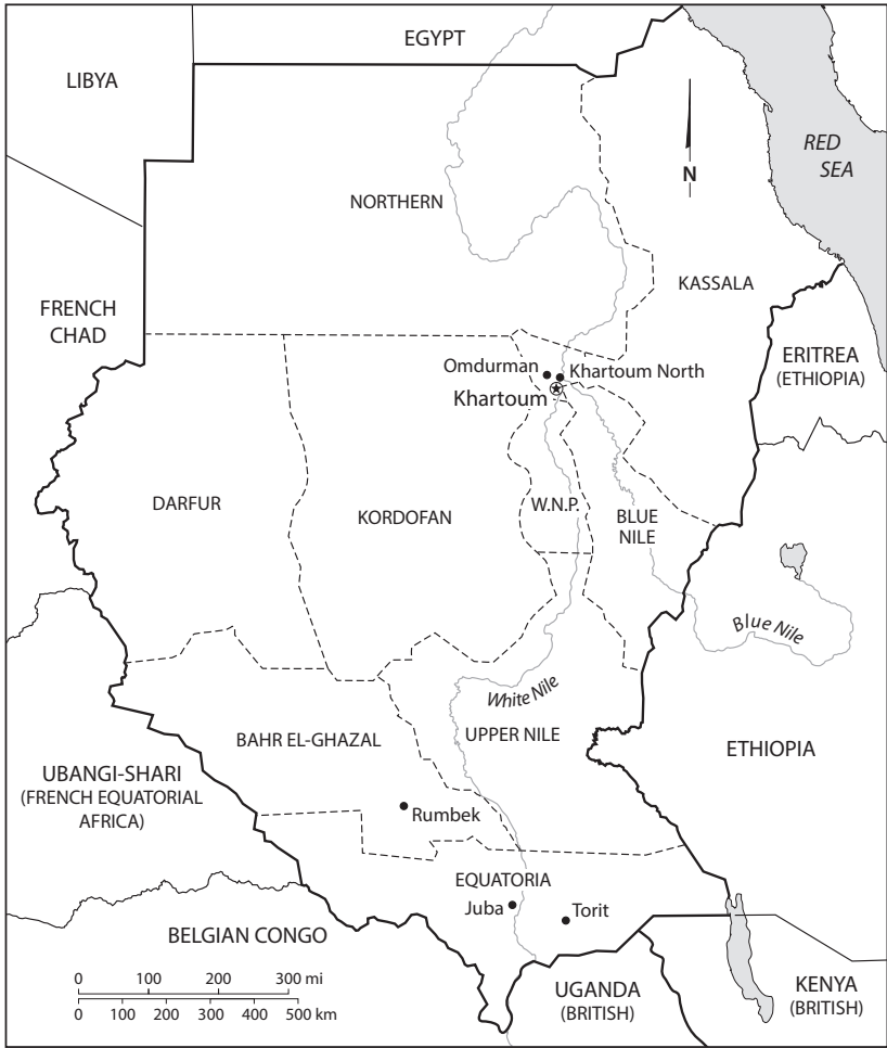
Sudan, ca. 1956.