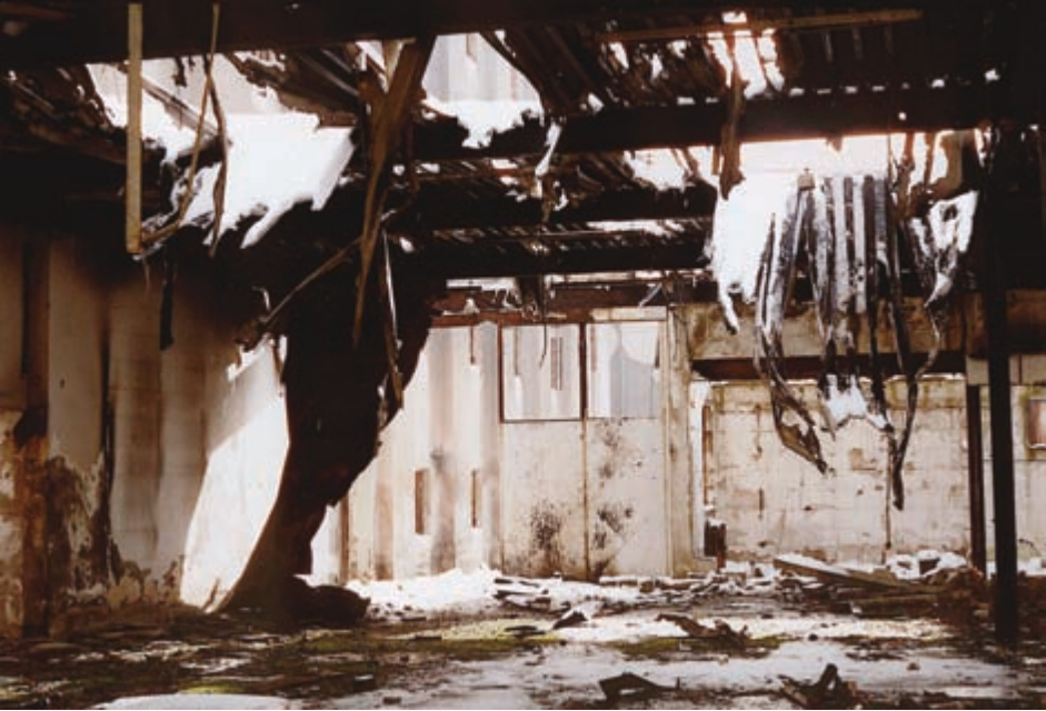
Along the main road from the airport to Sarajevo. December 1995.

had to protect themselves, psychologically as well as physically. We were on our own—defending our people.