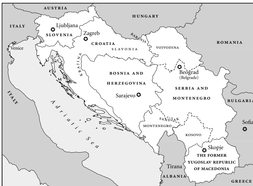
Former Yugoslavia.