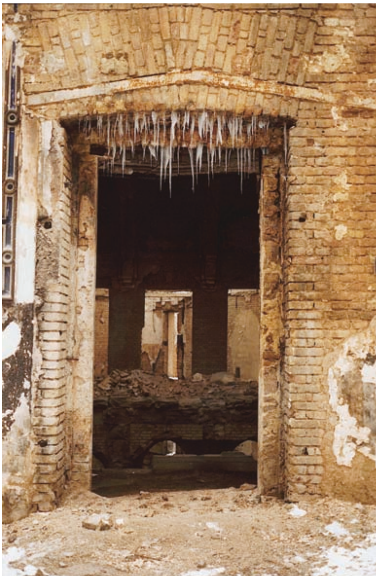
Inside the National Library in Sarajevo. December 1995.