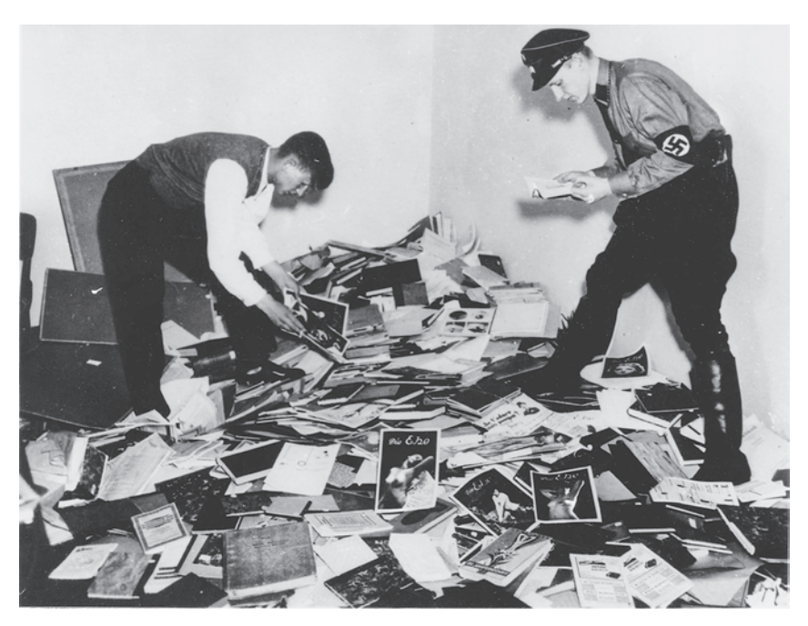
Figure 4.2 Members of the Hitler Youth select material for the book burning, 1933. Magnus-Hirschfeld-Gesellschaft.

at pictures, while the soldier is reading a page in a book. Closer inspection suggests that the photograph was staged in a way that sought to dissociate the Nazi men from the content of the materials in which they are so immersed. The picture is well lit and carefully composed. Strategically placed at the front of the mountain of books and papers are a number of photographs of topless women, apparently taken from the journal Die Ehe, the institute's publication on marriage. The conspicuous inclusion of these images heterosexualizes the materials handled by the Nazi men. Nazi propaganda and policy tended to decry and persecute both pornography and homosexuality.<sup>108</sup> However, here the prominent placing of photographs of topless women suggests that homophobic anxieties shaped the raid on the Institute of Sexual Science. The representation of Nazi hands on naked women manages to maintain the institute's association with sexual immorality even as these images also ensure that the Nazi men sent to cleanse the institute of its holdings are dissociated from homosexuality. Sharon Patricia Holland has argued that "if touch can be interpreted as the action that bars one from entry and also connects one to the sensual life of the other, then . . . racism has its own erotic life."109 Holland's observation on "the erotic life of racism," by which