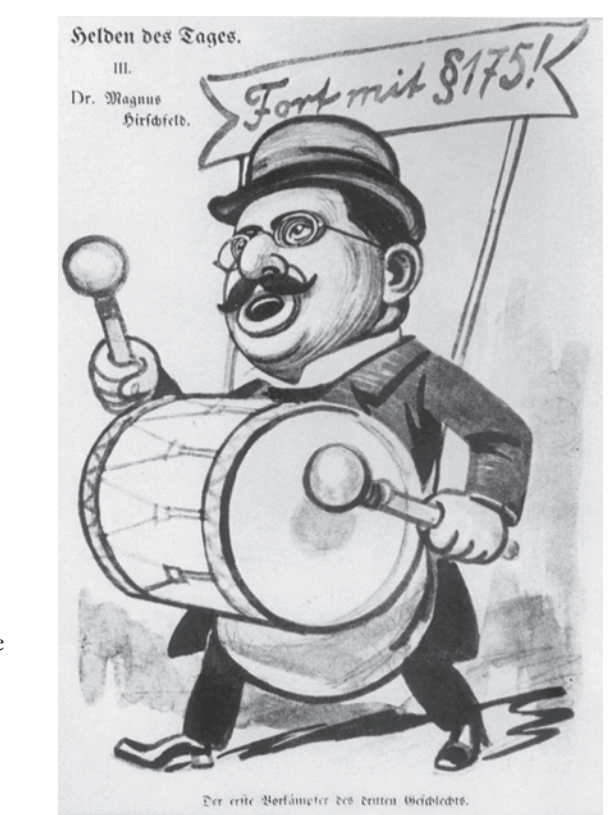
Figure 1.1 A 1907 political cartoon depicting sex-researcher Magnus Hirschfeld, "Hero of the Day," drumming up support for the abolition of Paragraph 175 of the German Penal Code, which criminalized homosexuality. The banner reads, "Away with Paragraph 175!" The caption reads, "The foremost champion of the third sex!"

While Hirschfeld did not address directly the antisemitism, he noted that the attacks against him in the wake of the Harden trial, a scandal that had started out as a response to the perceived weakening of Germany's colonial might, "brought the laborious achievements [of the fledgling homosexual rights movement] once more into question."<sup>89</sup> Hirschfeld noticed the rise of what Eve Kosofsky Sedgwick would later call "homosexual panic," a term she borrowed from the psychiatrist Edward Kempf, which describes "the most private, psychologized form in which many twentieth-century western men experience their vulnerability to the social pressure of homophobic blackmail."<sup>90</sup> According to Hirschfeld "it was after the Moltke-Harden scandal