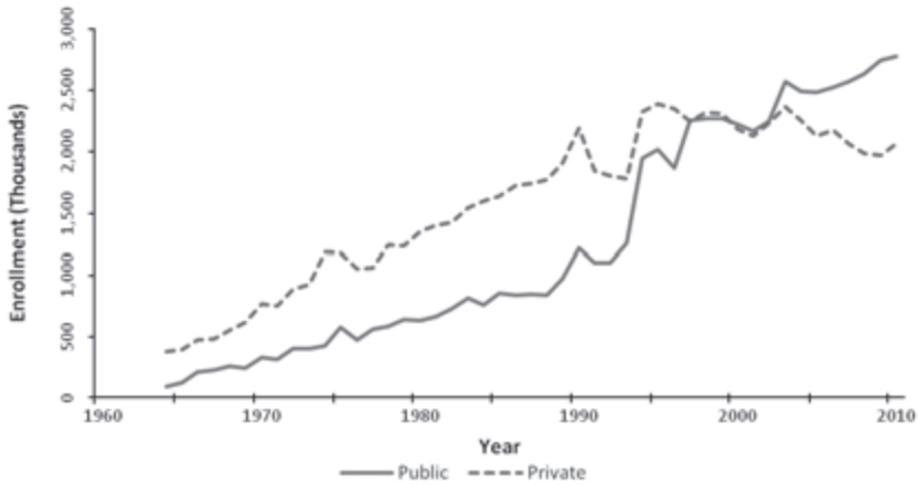
Fig. 1. Nursery school enrollment, 1964–2010. (Data from Current Population Survey.)

The second dimension along which preschool education in the United States differs from that of other countries is its public-sector decentralization. Government programs are administered at the national, state, and local levels. Dozens of national programs provide or support education and care for children under the age of five. They are administered by the Department of Education, the Department of Health and Human Services, and other agencies. In addition, many programs exist at the state level. During the 2009–10 academic year, forty states funded one or more prekindergarten initiatives (Barnett et al. 2010). One scholar characterizes this crowded landscape of governmental activity as a “hodgepodge of federal, state, and local funding streams and regulations” (Finn 2009, 27). This book focuses on national and state initiatives. Decentralization is a defining attribute of preschool education in the United States, whereas countries like France operate more-centralized systems.